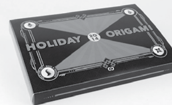
Holiday Origami Set