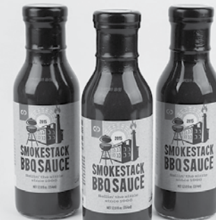
Smokestack BBQ Sauce