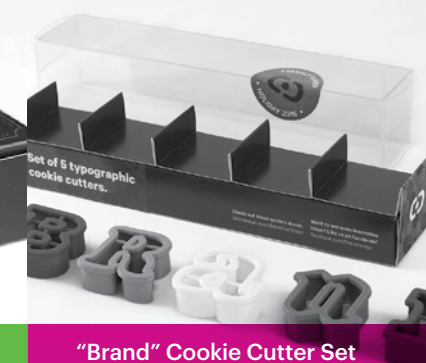
“Brand” Cookie Cutter Set