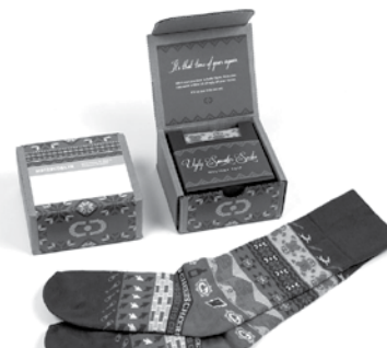
Ugly Sweater Socks