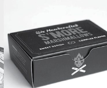
Bourbon S'more Kit