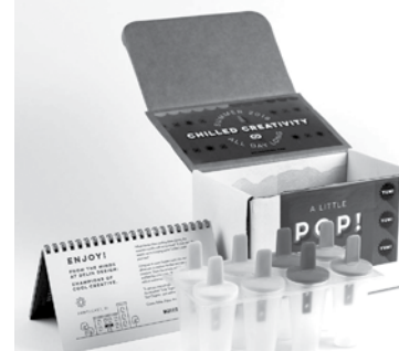
Popsicle Kit + Recipe Book